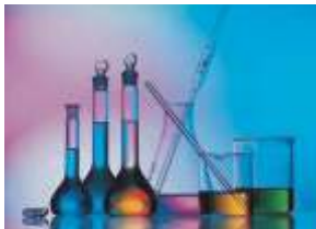
Chemical Industry - Organic & Inorganic