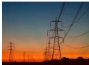
Power & Energy