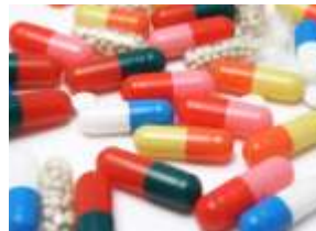
Pharmaceuticals & Biotech