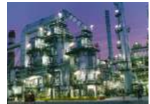
Petrochemicals & Refineries