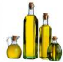
Fats & Oils