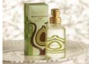
Soap, Perfumes & Cosmetics